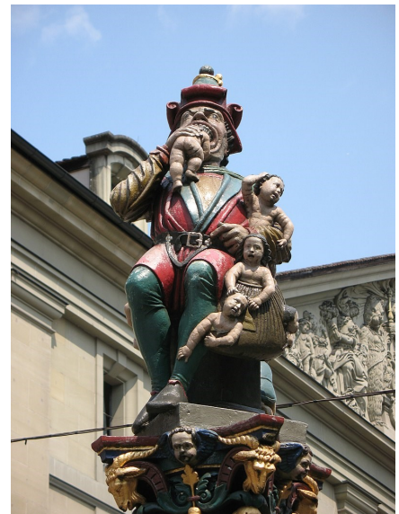
Kindlifresserbrunnen at Kornhausplatz