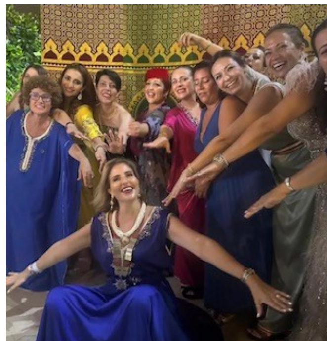
All the Past Presidents of LCI