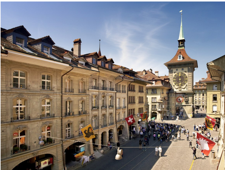
Zytglogge Tower, Kramgasse