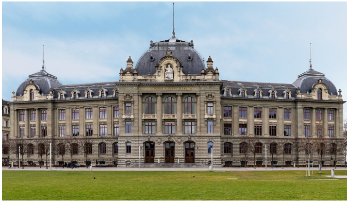
University of Bern