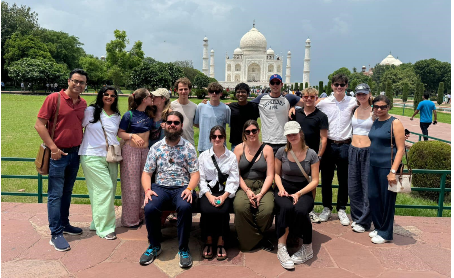
The Northern Group

At the end of July/early August two groups of YAPs visited India, one in the North and the other in the South. A comprehensive set of photographs of their adventures will appear in the October 41 International Times.