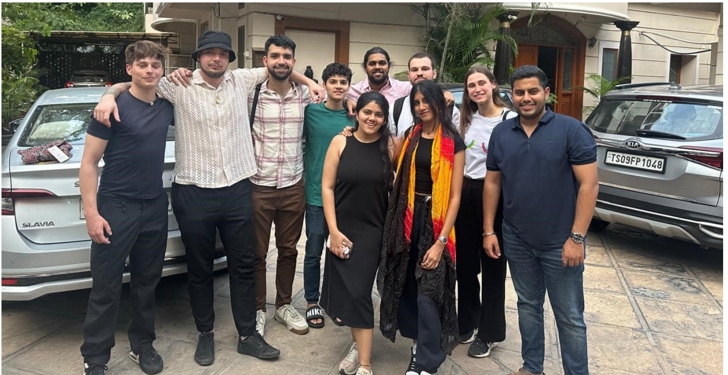
The Southern Group