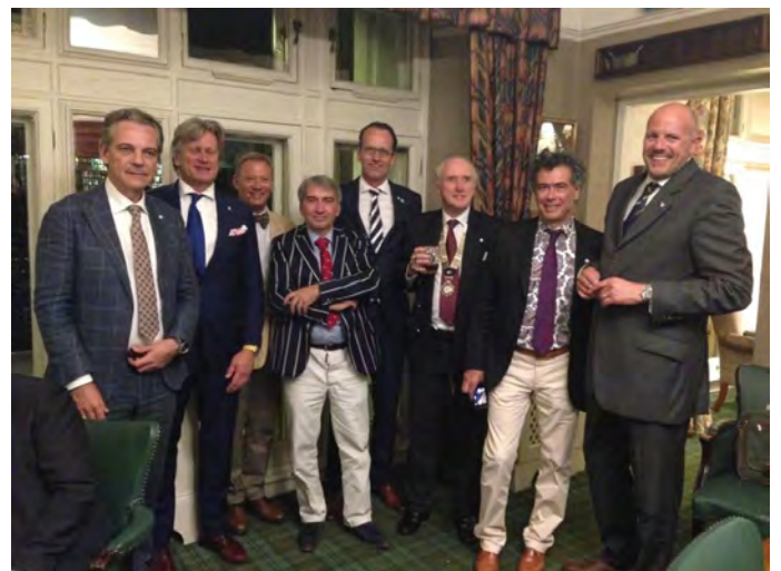
Visitors from Antwerp 41 Club with the LOTS Chairman