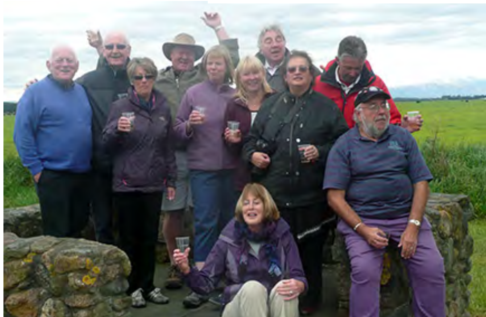
A large group of delegates from the HYM participated in a two week post event tour in New Zealand. Here we see the GB&I contingent.

The Board and Council of 41 Club GB&I wish a Very Merry Christmas and a Happy New Year to all members of the Round Table Family throughout the world